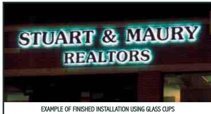
EXAMPLE OF FINISHED INSTALLATION USING GLASS CUPS

•TYPICAL UL LABEL SHOWN SIGN MUST BE LISTED BY QUALIFIED ELECTRICAL TESTING LABORATORY