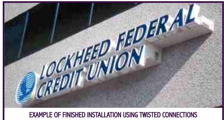
EXAMPLE OF FINISHED INSTALLATION USING TWISTED CONNECTIONS

• TYPICAL UL LABEL SHOWN SIGN MUST BE LISTED BY QUALIFIED ELECTRICAL TESTING LABORATORY