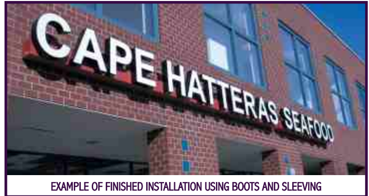
EXAMPLE OF FINISHED INSTALLATION USING BOOTS AND SLEEVEING

• TYPICAL UL LABEL SHOWN SIGN MUST BE LISTED BY QUALIFIED ELECTRICAL TESTING LABORATORY