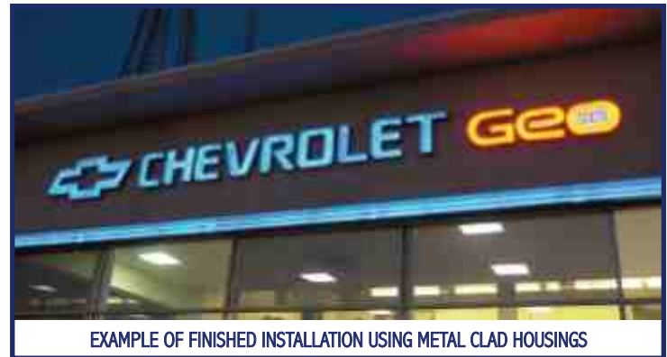
EXAMPLE OF FINISHED INSTALLATION USING METAL CLAD HOUSINGS

•TYPICAL UL LABEL SHOWN SIGN MUST BE LISTED BY QUALIFIED ELECTRICAL TESTING LABORATORY