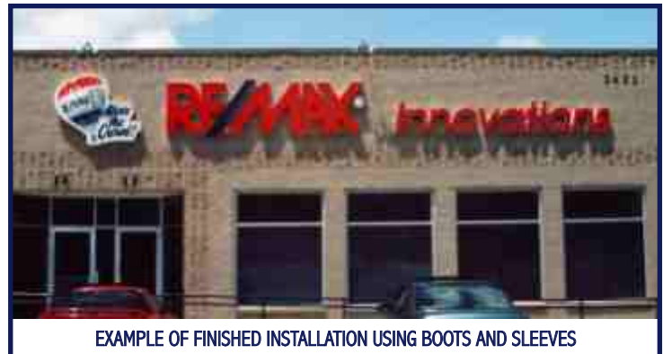
EXAMPLE OF FINISHED INSTALLATION USING BOOTS AND SLEEVES

•TYPICAL UL LABEL SHOWN SIGN MUST BE LISTED BY QUALIFIED ELECTRICAL TESTING LABORATORY