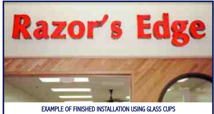
EXAMPLE OF FINISHED INSTALLATION USING GLASS CUPS

•TYPICAL UL LABEL SHOWN SIGN MUST BE LISTED BY QUALIFIED ELECTRICAL TESTING LABORATORY