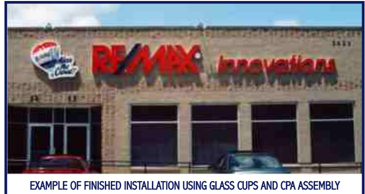
EXAMPLE OF FINISHED INSTALLATION USING GLASS CUPS AND CPA ASSEMBLY

•TYPICAL UL LABEL SHOWN SIGN MUST BE LISTED BY QUALIFIED ELECTRICAL TESTING LABORATORY