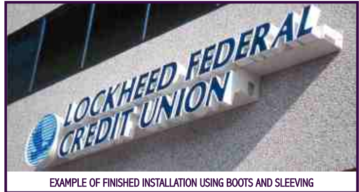
EXAMPLE OF FINISHED INSTALLATION USING BOOTS AND SLEEVING

• TYPICAL UL LABEL SHOWN SIGN MUST BE LISTED BY QUALIFIED ELECTRICAL TESTING LABORATORY