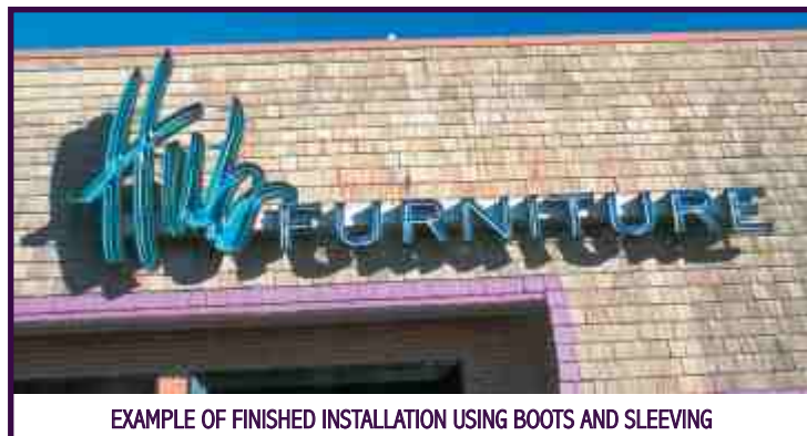
EXAMPLE OF FINISHED INSTALLATION USING BOOTS AND SLEEVING

• TYPICAL UL LABEL SHOWN SIGN MUST BE LISTED BY QUALIFIED ELECTRICAL TESTING LABORATORY