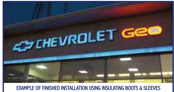
EXAMPLE OF FINISHED INSTALLATION USING INSULATING BOOTS & SLEEVES

•TYPICAL UL LABEL SHOWN SIGN MUST BE LISTED BY QUALIFIED ELECTRICAL TESTING LABORATORY