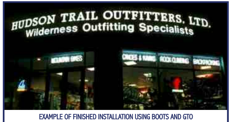
EXAMPLE OF FINISHED INSTALLATION USING BOOTS AND GTO

•TYPICAL UL LABEL SHOWN SIGN MUST BE LISTED BY QUALIFIED ELECTRICAL TESTING LABORATORY