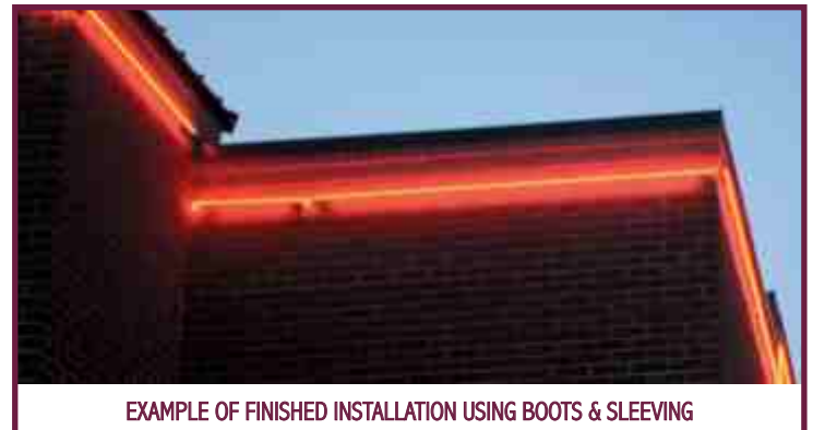
EXAMPLE OF FINISHED INSTALLATION USING BOOTS & SLEEVING

• TYPICAL UL LABEL SHOWN SIGN MUST BE LISTED BY QUALIFIED ELECTRICAL TESTING LABORATORY