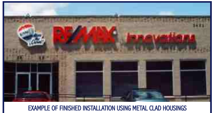
EXAMPLE OF FINISHED INSTALLATION USING METAL CLAD HOUSINGS

•TYPICAL UL LABEL SHOWN SIGN MUST BE LISTED BY QUALIFIED ELECTRICAL TESTING LABORATORY