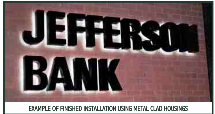
EXAMPLE OF FINISHED INSTALLATION USING METAL CLAD HOUSINGS

• TYPICAL UL LABEL SHOWN SIGN MUST BE LISTED BY QUALIFIED ELECTRICAL TESTING LABORATORY