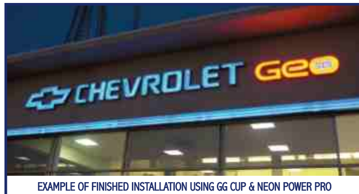
EXAMPLE OF FINISHED INSTALLATION USING GG CUP & NEON POWER PRO

•TYPICAL UL LABEL SHOWN SIGN MUST BE LISTED BY QUALIFIED ELECTRICAL TESTING LABORATORY