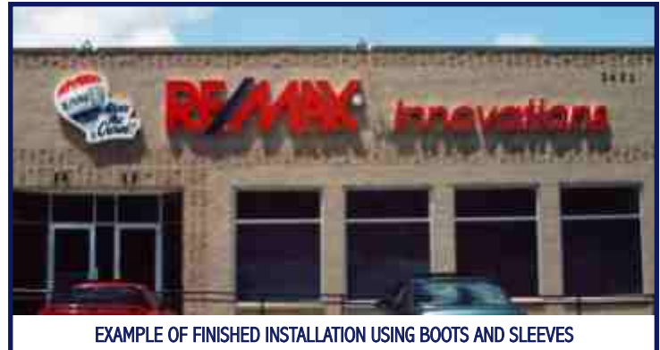
EXAMPLE OF FINISHED INSTALLATION USING BOOTS AND SLEEVES

•TYPICAL UL LABEL SHOWN SIGN MUST BE LISTED BY QUALIFIED ELECTRICAL TESTING LABORATORY