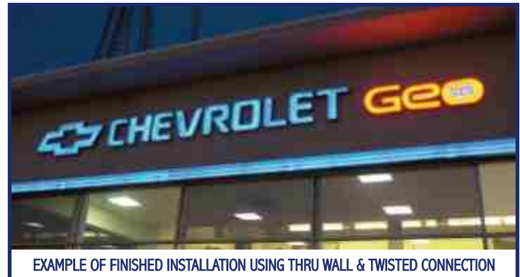
EXAMPLE OF FINISHED INSTALLATION USING THRU WALL & TWISTED CONNECTION

•TYPICAL UL LABEL SHOWN SIGN MUST BE LISTED BY QUALIFIED ELECTRICAL TESTING LABORATORY