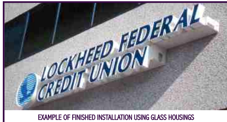
EXAMPLE OF FINISHED INSTALLATION USING GLASS HOUSINGS

• TYPICAL UL LABEL SHOWN SIGN MUST BE LISTED BY QUALIFIED ELECTRICAL TESTING LABORATORY